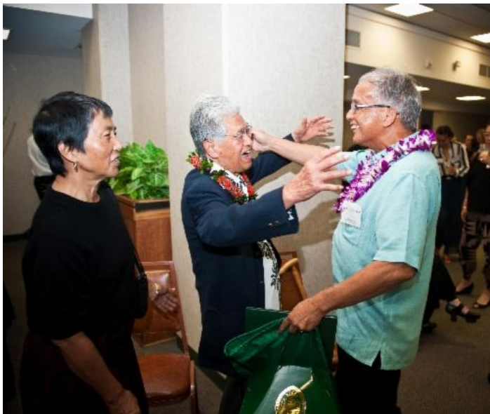
APIASF Advisory Council Member and former U.S. Representative from Guam Robert Underwood greets Senator Akaka to Monday night's Reception