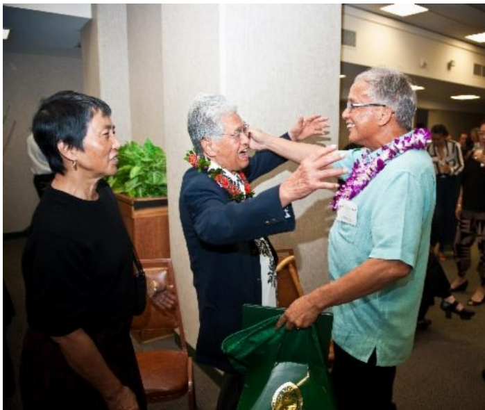
APIASF Advisory Council Member and former U.S. Representative from Guam Robert Underwood greets Senator Akaka to Monday night's Reception